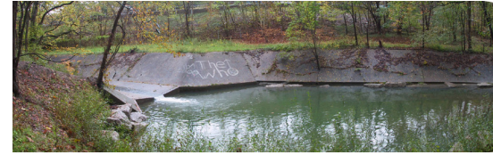
The existing channelized and polluted 9 Mile Run