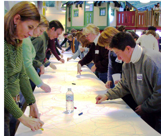
Participants at the 10 June 2006 charette help design the project.