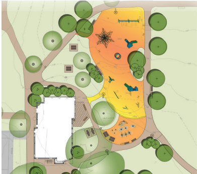
Accessible playground and sprayground site plan

VLS partnered with the Philadelphia Department of Public Property to redesign the playground at Stenton Park in North Philadelphia. Viridian designed a playground and sprayground that is fully accessible and provides a range of equipment for toddlers to teenagers. The sprayground greatly improves upon the existing spray feature (a single wall mounted spray on the north side of the building) by relocating it as a central play space with spray hoops that can be used for play even during the off-season. The site preserves almost all of the existing mature canopy trees by working around existing paved areas and minimizing grading within the canopy.