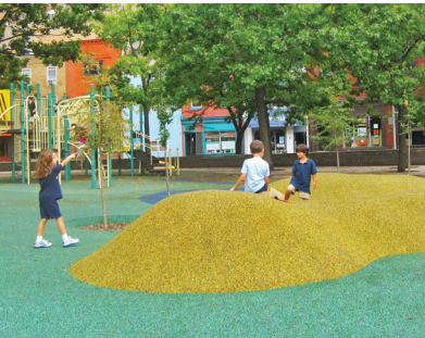
Phase 2 Rubber Surface Mounds and porous surface infiltrate stormwater

The design for Greenfield Elementary transforms the site into a living laboratory that teaches children about microclimates and other aspects of the natural environment. Bioswale with check dams slow run-off, allow absorption and are planted with a lush variety of native plants. The landscape evapotranspires stormwater, provides shade, and creates a mini native Pennsylvania forest ecosystem. Rain gauges, rain barrels & green roofs allow students to document and observe alternative technologies.