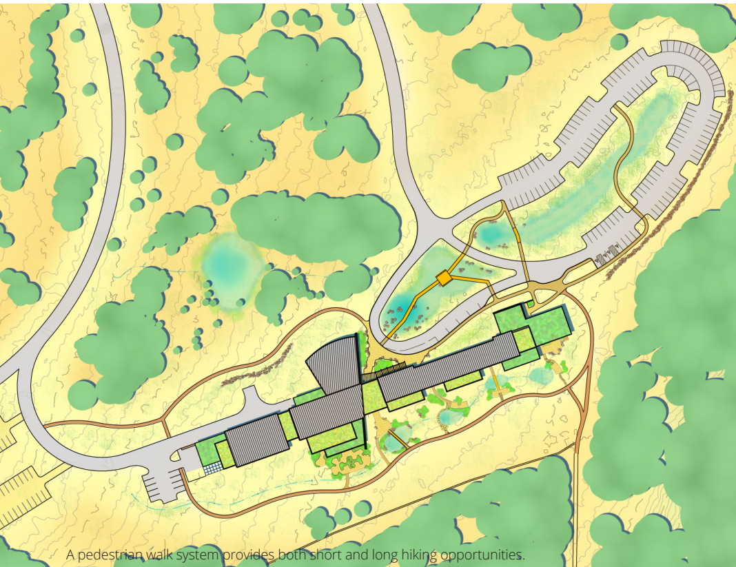
A pedestrian walk system provides both short and long hiking opportunities.