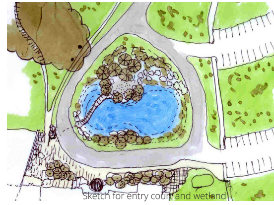
Sketch for entry court and wetland