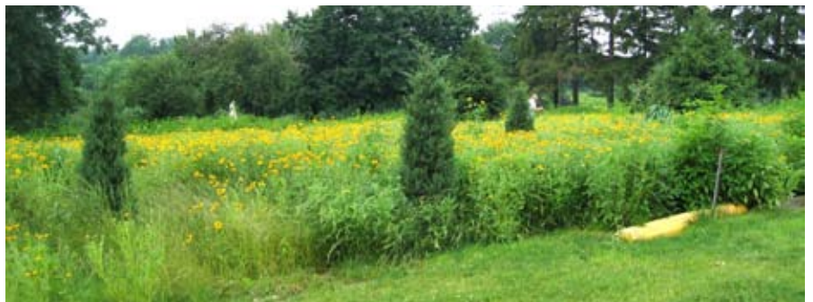
First Year Meadow Establishment

This award-winning project is home to a convent and school, constructed in the 1930s. The building renovation, designed by Perkins Eastman, Architects, required new handicapped-accessible entrances and clarification of the site's vehicular circulation and parking. The building and site demonstrate sustainable design and is in the process of becoming LEED certified.