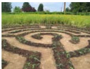
Installation of Labyrinth