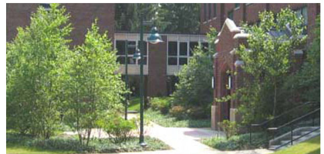
Intimate School & Convent Courtyard Entrances are multipurpose gathering spaces.